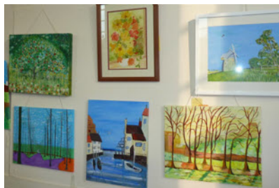
Summer exhibition 2012

All proceeds go to the Aylesford Cancer Centre, Warwick Hospital and Oxhill Village Hall.