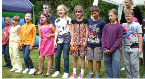
Entertainment from the Chernobyl children at the 2011 Coffee Morning