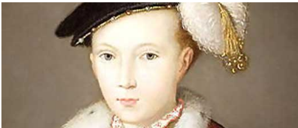
Young King Edward VI

In the survey, Oxhill churchwardens declared a chalice, eight bells (four large, two small) two copes, a velvet cushion, six altar cloths, a brass pyx (for holding the Sacrament), some towels, tin “cruets” for water and wine, some streamers (for processions), a brass basin, two brass candlesticks and a brass processional cross. (Also “Tow tan clothes” – (two? leather cloths?))